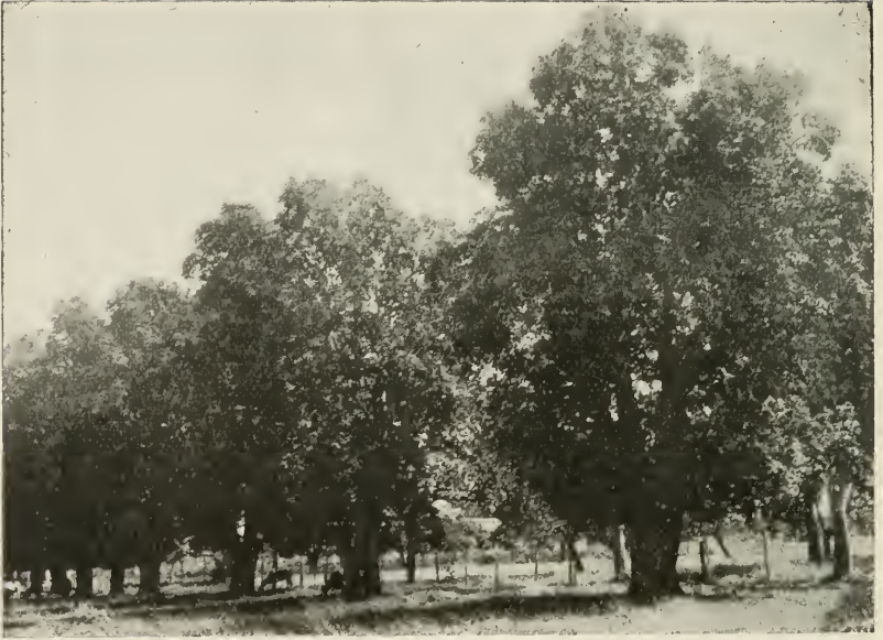
OLD SEEDLING TREES OF THE MANGO RACE, NEAR SANTIAGO DE LAS VEGAS.